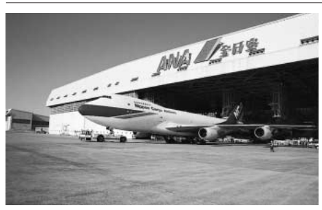
An NCA jet leaves a hanger after receiving maintenance.

Upon entering the 1990s, ISO concepts for international quality standards became general for aircraft maintenance organizations and functions. Many countries mandated legal certified of maintenance organizations. In Japan as well, a system of certified maintenance worksites was included in revisions to the Aviation Law. NCA's maintenance division established a new Maintenance Audit Office in October