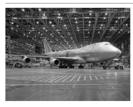
A B747-400F rolls out (Boeing's Everett Plant in Seattle)

Against this backdrop, NCA formed the New Aircraft Selection and Adoption Committee in March 2003 under President Uchiyama. It began studying the selection and adoption of new aircraft to replace the existing ones. This resulted in the decision to adopt four new B747-400Fs, two in FY 2005 and two in FY 2006. They were selected because they have at least as much cargo capacity and range as current models, provide outstanding operating economy, can fly nonstop between Japan and Europe, can build an efficient production system for both NCA and ANA, and minimize investment costs. In addition,